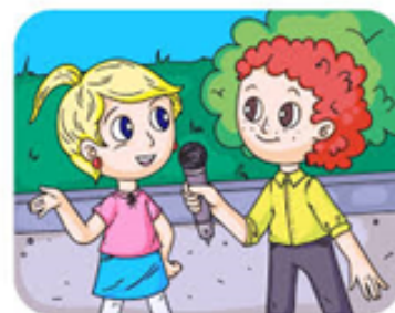
1/2's, Making News

Well done to all the families for a fantastic effort with our Book Character dress-up day! The kids looked amazing and had a great time pretending to be someone else for the day. It's a pity we couldn't all be together to enjoy the fun. It's been a tough couple of weeks in the 1/2 classes, with many students out due to illness, but it's wonderful to see more smiling faces returning and fewer coughs and sniffles.